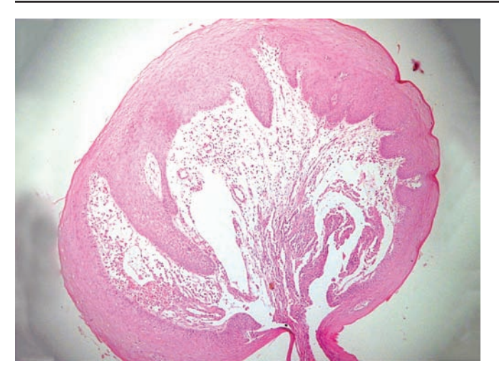
Fig. 5: Histopathological analysis

in the lower lip (77.9%), tongue (9.9%), and the floor of mouth (5.7%).