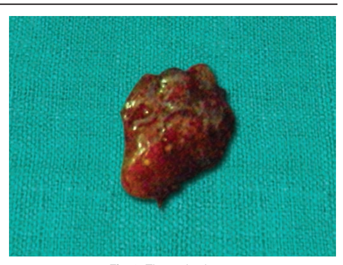
Fig. 2: The excised mass