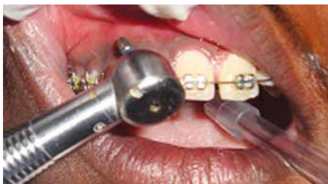
Fig. 9B: Intraoperative view of the patient while undergoing treatment on the right side with a diamond abrasive (Case 7)