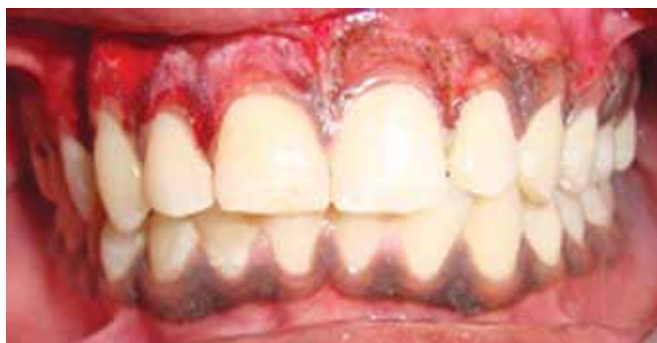
Fig. 8D: Immediate postoperative view of the patient (Case 6)