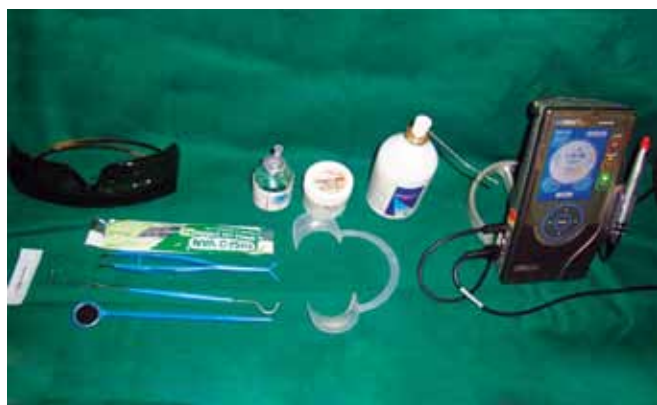
Fig. 2: Armamentarium used for the comparative study

The upper jaw was divided into two quadrants. The first right side quadrant was anesthetized with local anesthetic injection and diamond abrasive was used to peel the outer epithelium (Figs 3B, 4B, 5B, 6B, 7B, 8B, 9B, 10B, 11B and 12B). The second left side quadrant was given a topical gel/spray application if needed and treated with the help of lasers to bring about the depigmentation (Figs 3C, 4C, 5C, 6C, 7C,