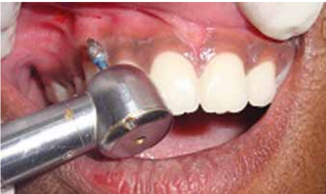
Fig. 10B: Intraoperative view of the patient while undergoing treatment on the right side with a diamond abrasive (Case 8)