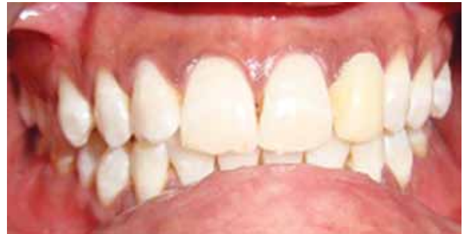
Fig. 5A: Preoperative view of the patient (Case 3)