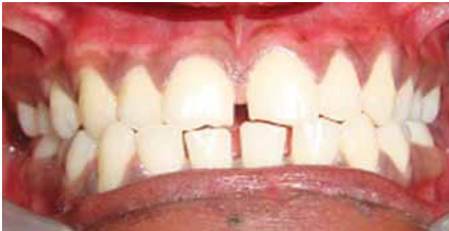
Fig. 4F: Six months postoperative view (Case 2)