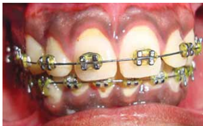
Fig. 7A: Preoperative view of the patient (Case 5)