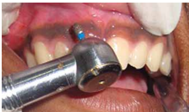
Fig. 3B: Intraoperative view of the patient while undergoing treatment on the right side with a diamond abrasive (Case 1)