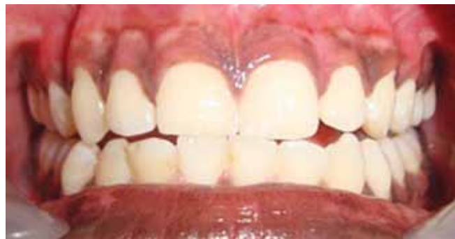
Fig. 8E: One month postoperative view (Case 6)