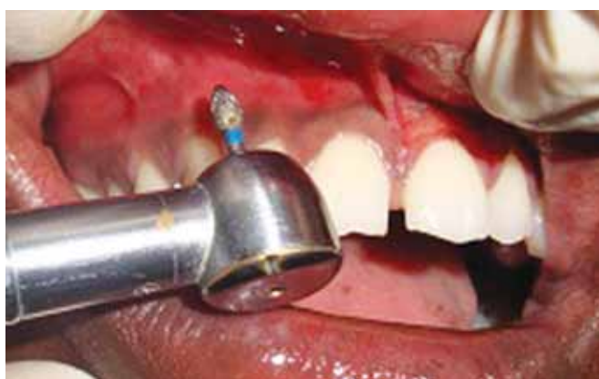
Fig. 4B: Intraoperative view of the patient while undergoing treatment on the right side with a diamond abrasive (Case 2)