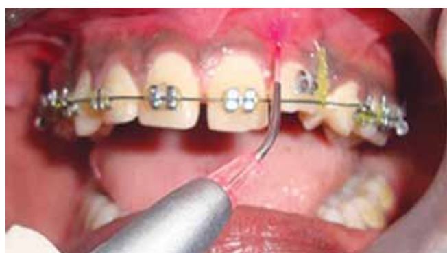
Fig. 9C: Intraoperative view of the patient while undergoing treatment on the left side with 940 nm diode laser (Case 7)