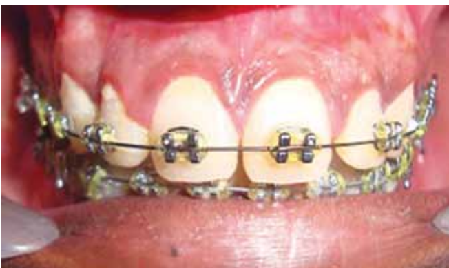
Fig. 7F: Six months postoperative view (Case 5)