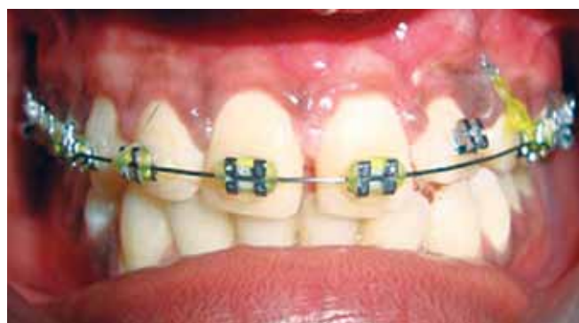
Fig. 9E: One month postoperative view (Case 7)