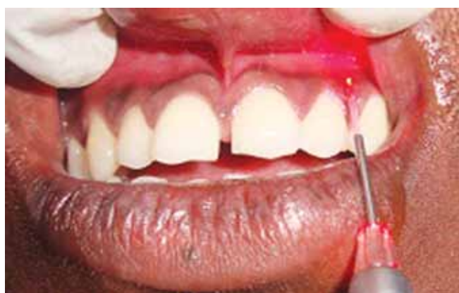
Fig. 4C: Intraoperative view of the patient while undergoing treatment on the left side with 940 nm diode laser (Case 2)