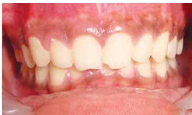
Fig. 3F: Six months postoperative view (Case 1)