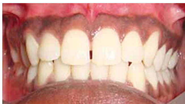
Fig. 12A: Preoperative view of the patient (Case 10)