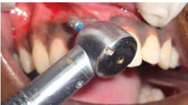
Fig. 8B: Intraoperative view of the patient while undergoing treatment on the right side with a diamond abrasive (Case 6)