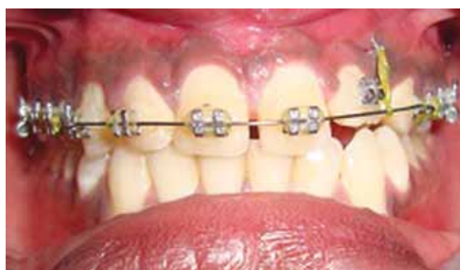
Fig. 9A: Preoperative view of the patient (Case 7)