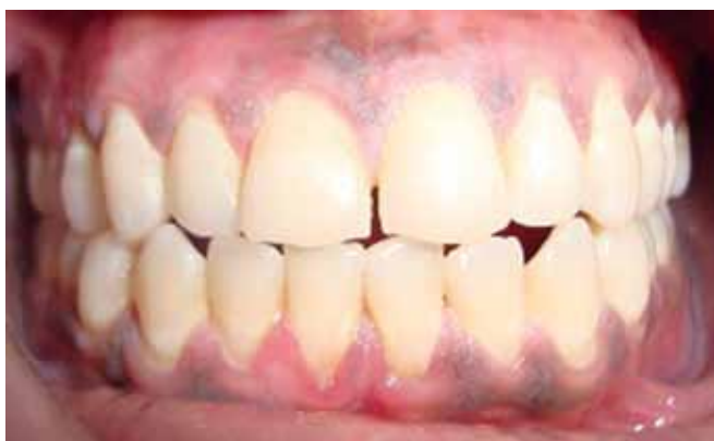
Fig. 6F: Six months postoperative view (Case 4)