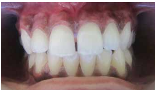
Fig. 12F: Six months postoperative view (Case 10)

lymphatic vessels thereby reducing the swelling and pain in the surgical site.