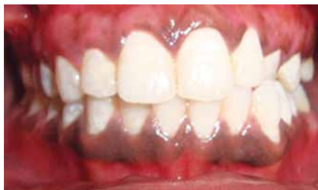
Fig. 11E: One month postoperative view (Case 9)