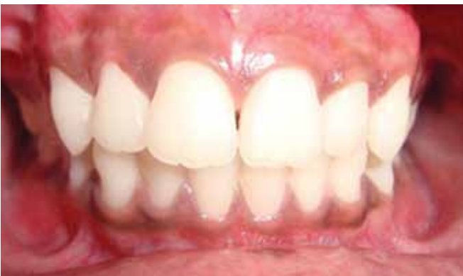
Fig. 10F: Six months postoperative view (Case 8)