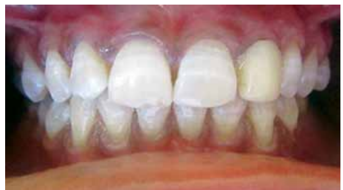
Fig. 5E: One month postoperative view (Case 3)