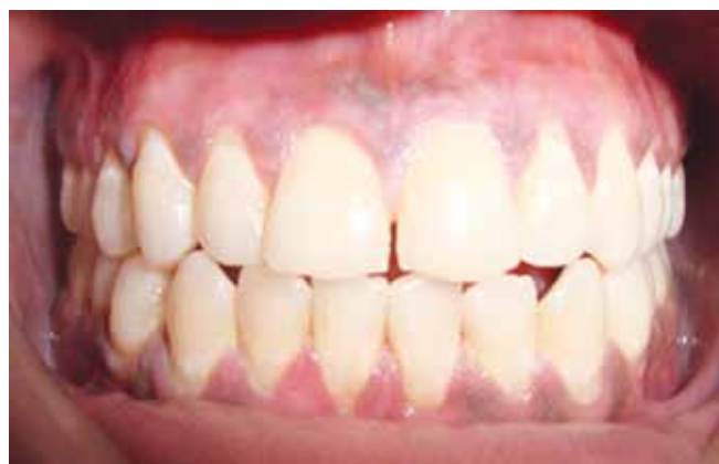
Fig. 6E: One month postoperative view (Case 4)