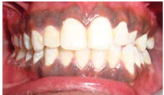
Fig. 11A: Preoperative view of the patient (Case 9)