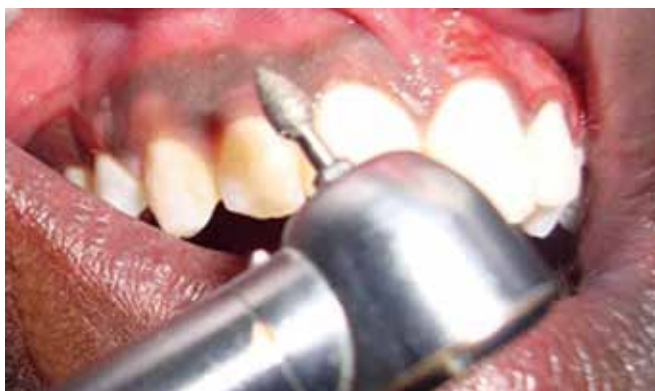
Fig. 11B: Intraoperative view of the patient while undergoing treatment on the right side with a diamond abrasive (Case 9)