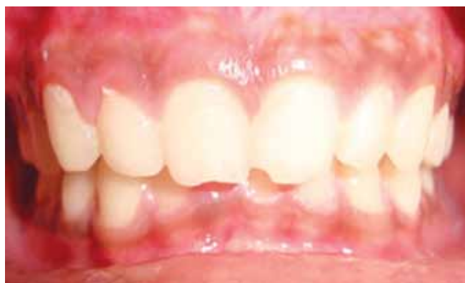
Fig. 3E: One month postoperative view (Case 1)