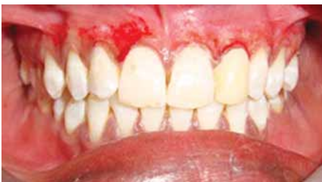
Fig. 5D: Immediate postoperative view of the patient (Case 3)