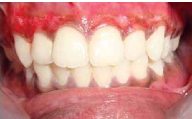
Fig. 10D: Immediate postoperative view of the patient (Case 8)