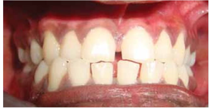
Fig. 4E: One month postoperative view (Case 2)