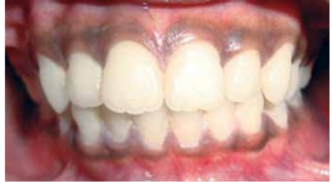
Fig. 10A: Preoperative view of the patient (Case 8)