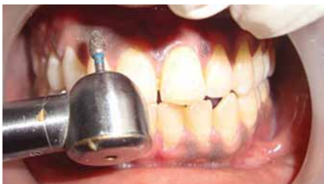
Fig. 6B: Intraoperative view of the patient while undergoing treatment on the right side with a diamond abrasive (Case 4)