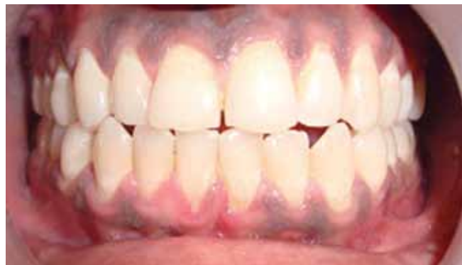
Fig. 6A: Preoperative view of the patient (Case 4)