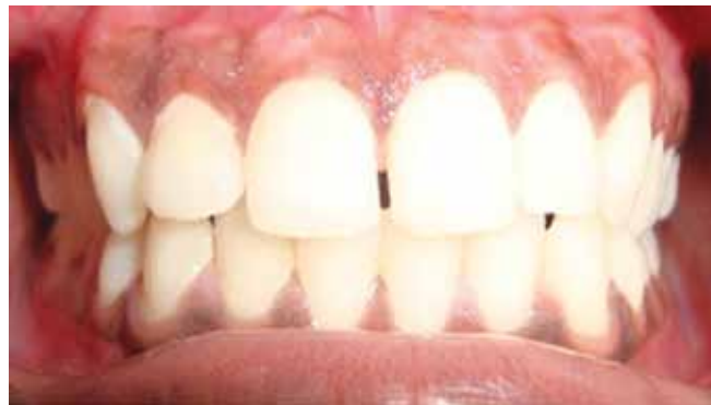
Fig. 12E: One month postoperative view (Case 10)