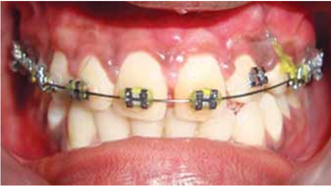
Fig. 9F: Six months postoperative view (Case 7)