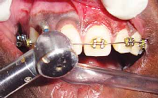
Fig. 7B: Intraoperative view of the patient while undergoing treatment on the right side with a diamond abrasive (Case 5)