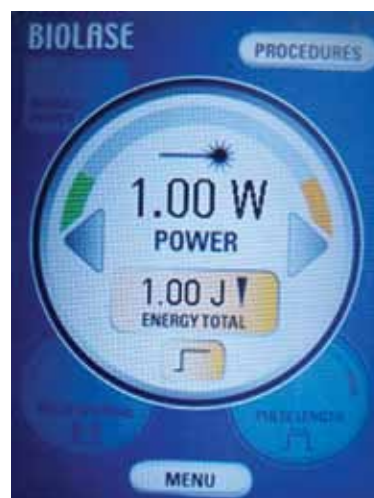
Fig. 13: Laser parameters on the control panel of 940 nm diode

Five out of 10 patients had taken medication to reduce the pain during the healing period and also applied some topical medicated gels (Hexigel, ICPA Health Products, India) on the right side. The total treatment period and the prognosis were monitored in all patients for 6 months postoperatively. The recurrence pattern and rate was also quantified. Three out of 10 patients had recurrence of some melanin pigmentation in the right side, and only one patient showed the reappearance of pigments on the laser treated site. This could be due to the level of highly pigmented gingiva in the patient as compared to the rest in the study group.