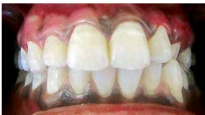
Fig. 11F: Six months postoperative view (Case 9)