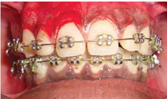
Fig. 7D: Immediate postoperative view of the patient (Case 5)