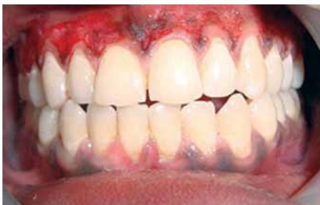
Fig. 6D: Immediate postoperative view of the patient (Case 4)