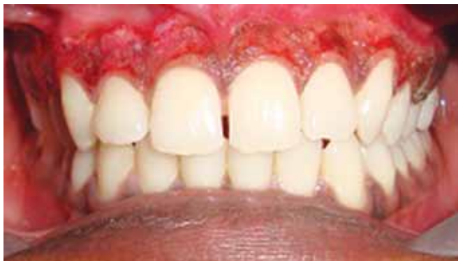
Fig. 12D: Immediate postoperative view of the patient (Case 10)