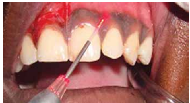
Fig. 8C: Intraoperative view of the patient while undergoing treatment on the left side with 940 nm diode laser (Case 6)