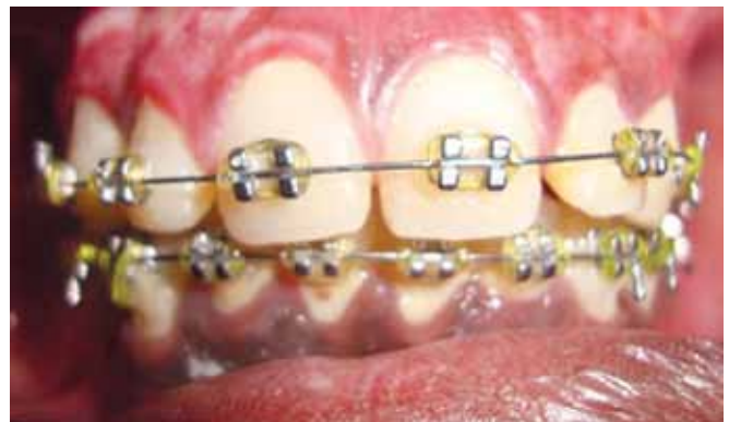
Fig. 7E: One month postoperative view (Case 5)