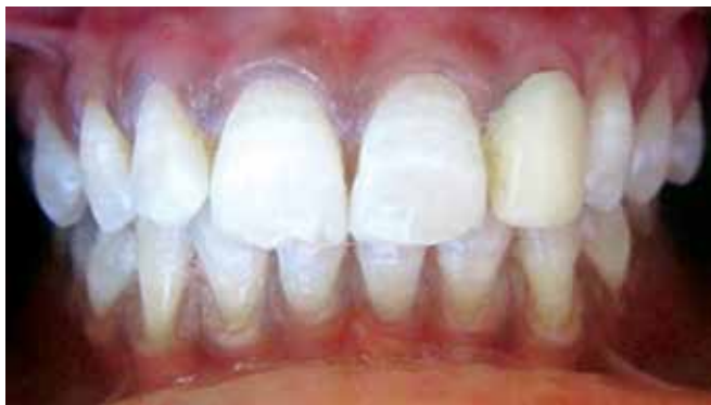
Fig. 5F: Six months postoperative view (Case 3)