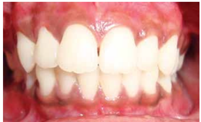
Fig. 10E: One month postoperative view (Case 8)