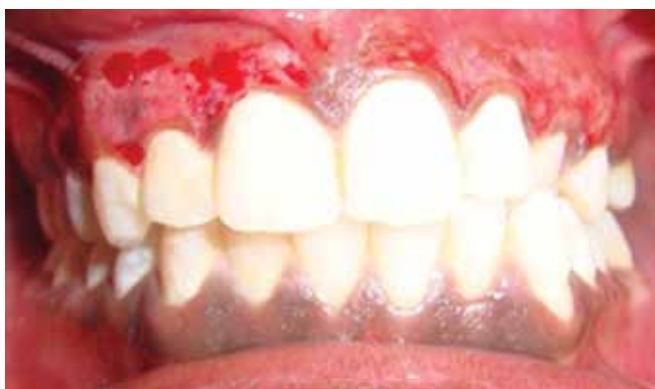
Fig. 11D: Immediate postoperative view of the patient (Case 9)