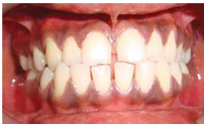
Fig. 4A: Preoperative view of the patient (Case 2)