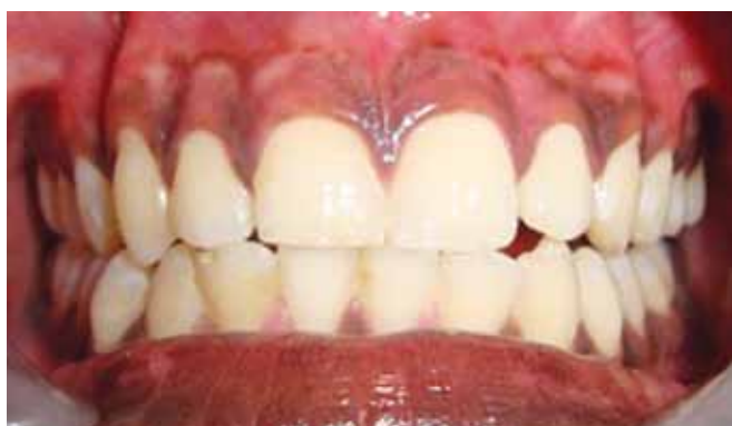
Fig. 8F: Six months postoperative view (Case 6)