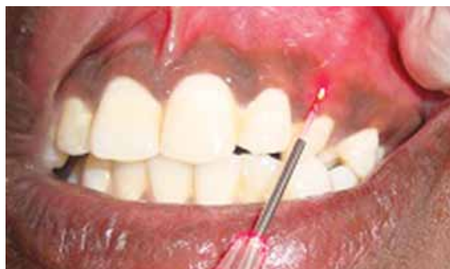
Fig. 11C: Intraoperative view of the patient while undergoing treatment on the left side with 940 nm diode laser (Case 9)