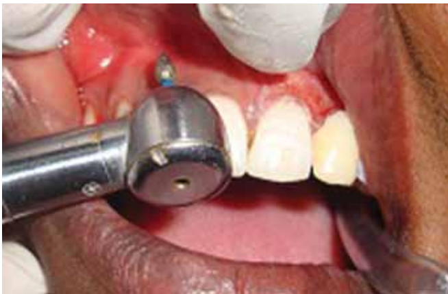
Fig. 5B: Intraoperative view of the patient while undergoing treatment on the right side with a diamond abrasive (Case 3)