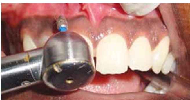
Fig. 12B: Intraoperative view of the patient while undergoing treatment on the right side with a diamond abrasive (Case 10)