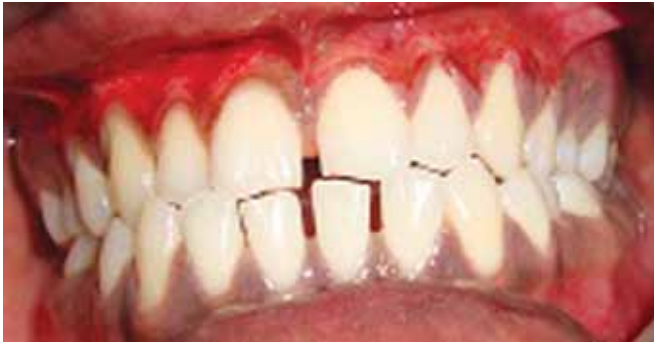
Fig. 4D: Immediate postoperative view of the patient (Case 2)