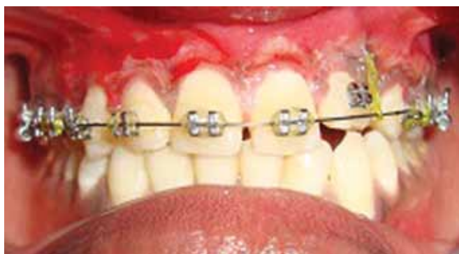
Fig. 9D: Immediate postoperative view of the patient (Case 7)