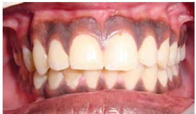
Fig. 8A: Preoperative view of the patient (Case 6)