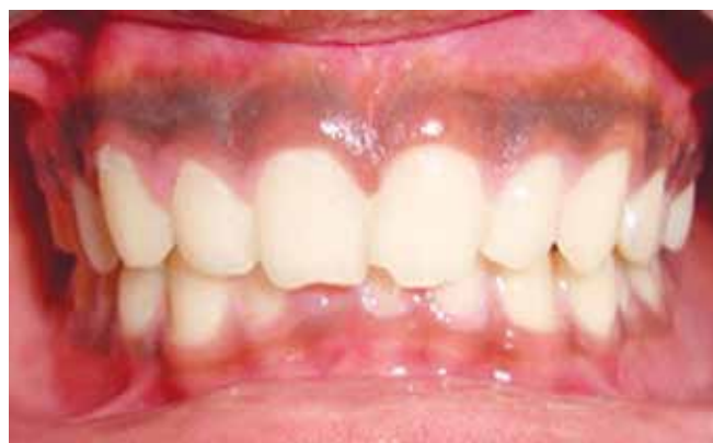
Fig. 3A: Preoperative view of the patient (Case 1)