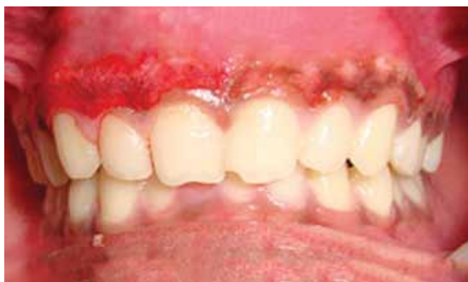
Fig. 3D: Immediate postoperative view of the patient (Case 1)