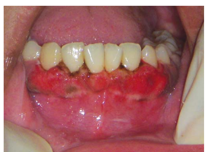
Fig. 3: Immediate postoperative view