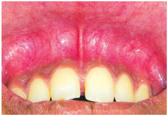
Fig. 5: Preoperative view showing high maxillary labial frenum attachment

A 12-year-old female patient was referred from the Department of Orthodontics with high maxillary labial frenal attachment (class II)<sup>4</sup> which resulted in midline diastema (Fig. 5). Diode laser of wavelength 810 nm and power of 2 W in contact mode was used which consisted of a simple incision which extended from the attached gingiva to the vestibule separating the fibers (Fig. 6). The incision was extended laterally to excise the fibrous tissue on the lateral aspect as well. Since, the laser seals both nerve endings and capillaries, postoperative discomfort and bleeding were almost nonexistent, and the need for postoperative suturing was eliminated (Fig. 7). Neither periodontal dressing was