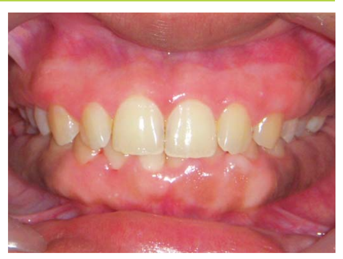
Fig. 4: One year postoperative view

depigmentation procedure continued until no pigmentation remained. After wiping the operation field for the last time, there was slight bleeding (Fig. 3). No periodontal dressing was applied nor was any analgesic prescribed. Healing was satisfactory 1 week postoperatively. When the patient returned after 1 year for follow-up, mild patchy pigmentation reappeared (Fig. 4).