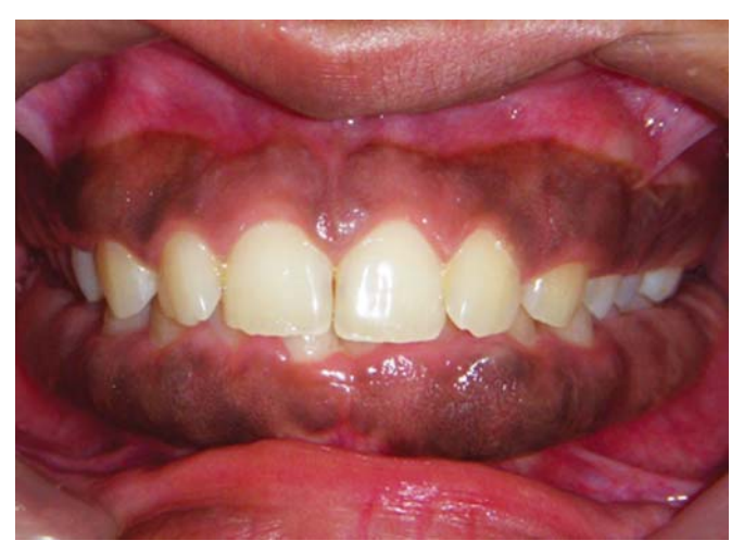
Fig. 1: Preoperative view showing melanin hyperpigmentation

performed in the anterior region of the maxillary and mandibular arch. Diode laser of wavelength 810 nm and power of 5 W in non-contact mode was used in sweeping motion in the pigmented areas (Fig. 2). Every 5 minutes, the operation area was wiped with sterile gauze soaked in normal saline solution to remove the charred tissue. The