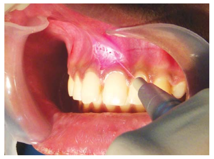
Fig. 6: Diode laser being used

applied nor was analgesic prescribed. After 6 months, the frenal attachment was stable (Fig. 8).