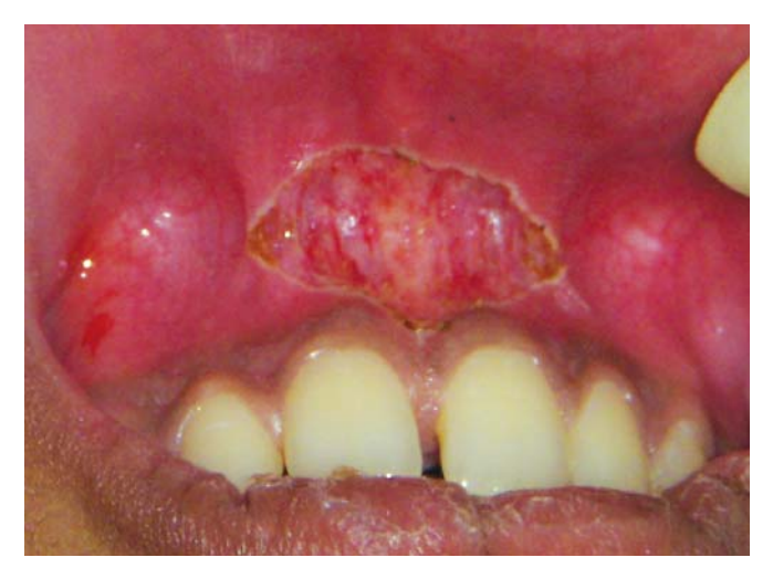
Fig. 7: Immediate postoperative view