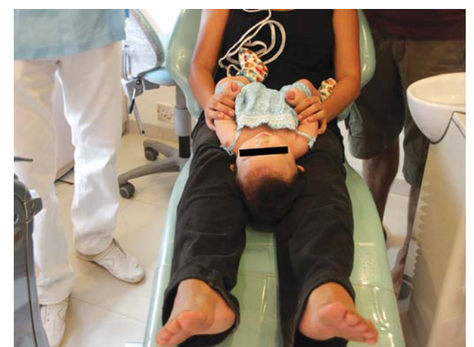
Fig. 4: Indian baby bath position

Psychological preparation of the mother is the first step in preparing the infant. Counseling and emotional support from both the dentist and lactation consultant are the cornerstone of successful treatment outcomes for neonates.