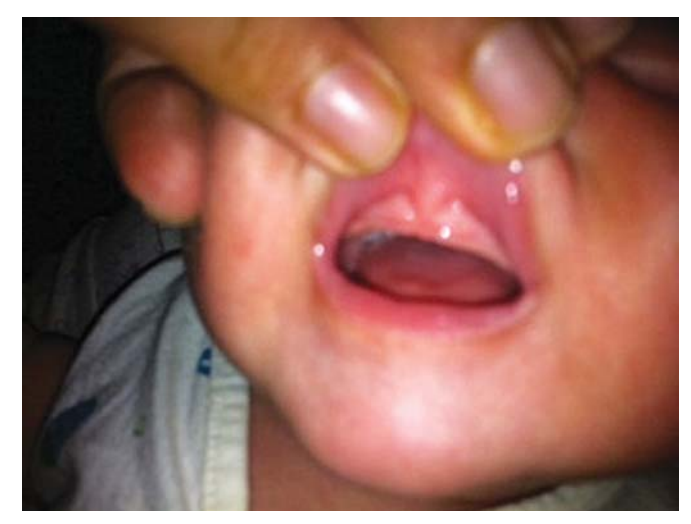
Fig. 2: Thick labial frenum

revealed a high thick labial frenum which was diagnosed to be grade II according to Dr Lawrence Kotlow's classification (Fig. 2).