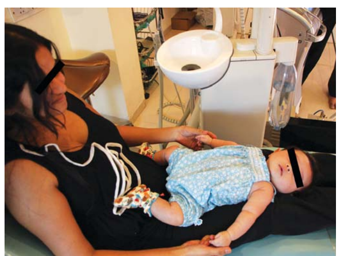
Fig. 3: Patient positioning