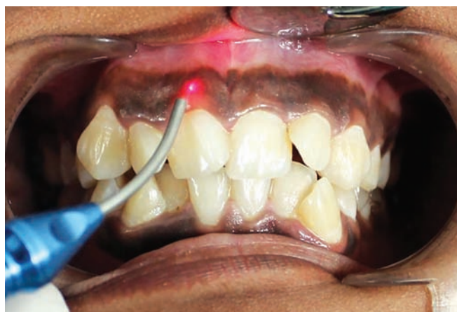
Fig. 2: Preoperative picture of patient