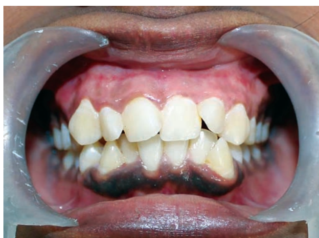
Fig. 3: Postoperative picture of patient

Preoperative (Fig. 2) and postoperative (Fig. 3) observations about the gingival melanin pigmentation were made according to Dummett–Gupta Oral Pigmentation Index scoring criteria given by Dummett and Gupta 15 : 0 – No clinical pigmentation (pink gingiva) 1 – Mild clinical pigmentation (mild light brown color) 2 – Moderate clinical pigmentation (medium brown or mixed pink and brown color)