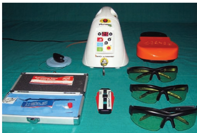
Fig. 1: Semiconductor diode laser used in study