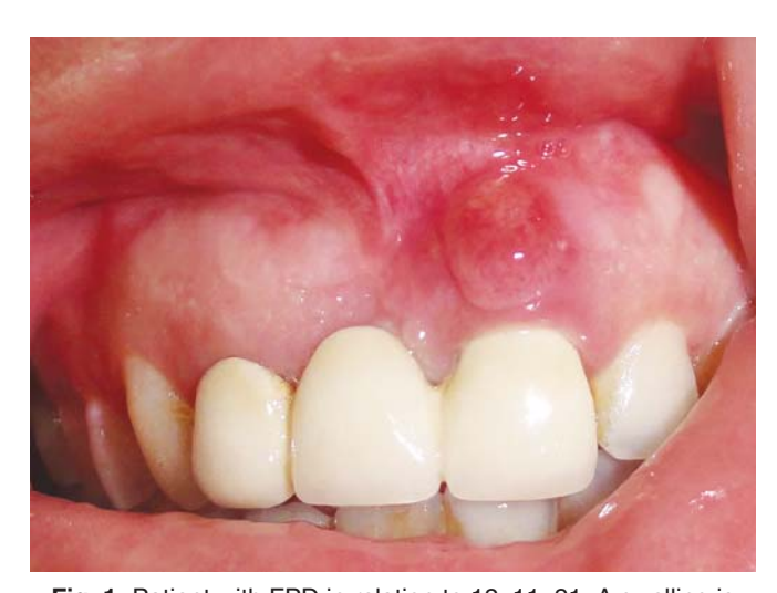
Fig. 1: Patient with FPD in relation to 12, 11, 21. A swelling is seen in relation to 21

A rectangular flap was raised and on examination of 21 after elevation, it revealed the presence of a fracture in 21 (Figs 2 and 3). The presence of vertical fracture was suggestive of poor prognosis to salvage the tooth. Hence,