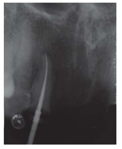
Fig. 5: IOPA showing working length determination in 12