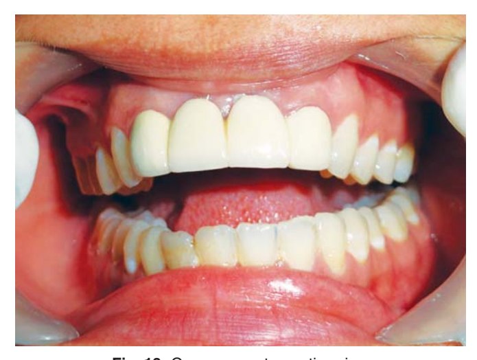
Fig. 13: One year postoperative view

surgically close the communication. On elevation of the flap, a vertical fracture was detected. So the decision was made to extract 21 atraumatically.<sup>2</sup> Retreatment of the root canal treated 21 was not considered due to the following reasons: