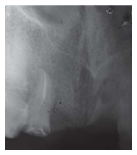
Fig. 7: IOPA showing sectional obturation in 12