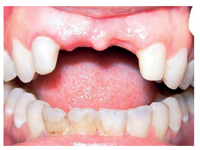
Fig. 10: Immediate postoperative view after post placement and core build-up done in 12 and crown preparation done in 22