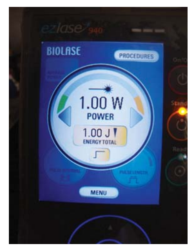
Fig. 6: Laser settings (Diode 940 mm, Ezlase, Biolase, USA)

2 mm/sec was done, 4 times in the canal with 5 seconds interval.