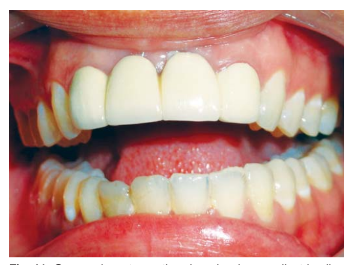
Fig. 11: One week postoperative view showing excellent healing of extracted and troughed region with permanent bridge placement